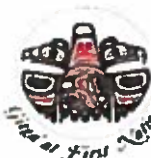
Gitga'at First Nation